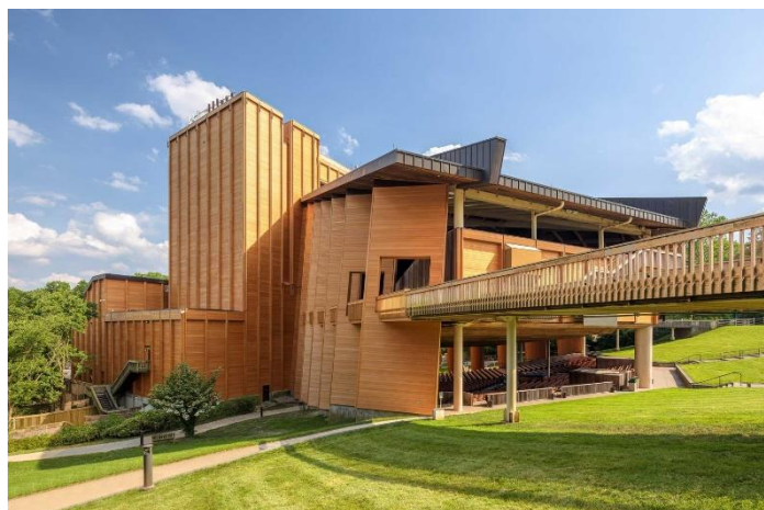
Exterior: SaferWood with Thermex-FR, Douglas Fir, Siding Project: The Filene Center, Wolf Trap, VA (2021), 500,000 BF

CONTACT US FOR A QUOTE OR FREE PROJECT CONSULTATION