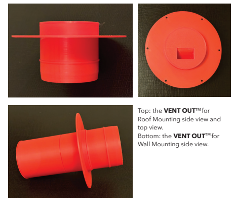
Top: the VENT OUT™ for Roof Mounting side view and top view. Bottom: the VENT OUT™ for Wall Mounting side view.

In the roof application, the VENT OUT™ creates a watertight connection between the exhaust duct that is typically run through the attic and the roof sheeting until the roof cap is installed. It is mounted from the inside attic space to a hole cut in the roof deck. It has a removable temporary cap that keeps the connection to the roof sheeting watertight. The cap is removed during the installation of the roof cap and the roofing material.