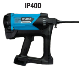
IP40D Low-Mid Range PSI Use with Insulation Pins 1" - 4"

Thermal-Grip ® IP Insulation Fastening Tools to rapidly attach insulation to concrete, masonry, and tilt up/ precast walls