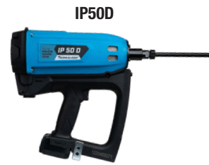
IP50D Mid-High Range PSI Use with Insulation Pins 1.5" - 6"